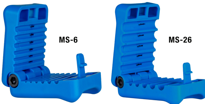
PULL TO SLIT: