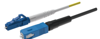
FUSION SPLICE-ON CONNECTORS